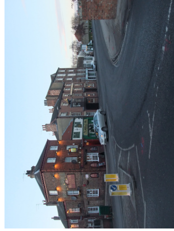
A group of listed buildings in the Fishergate character area