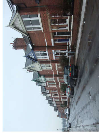
A row of Edwardian houses on Scarcoft Hill, within The Mount character area