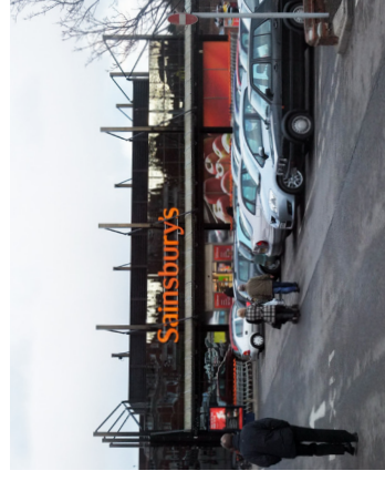
This modern supermarket contributes nothing to the special interest of the Conservation Area