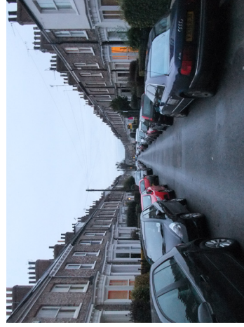
St John Street is an attractive uniform and well-preserved street off Lord Mayor's Walk